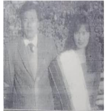
Function Chairman & Secretary