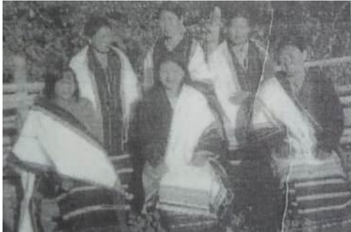
Makhani Women Development Society