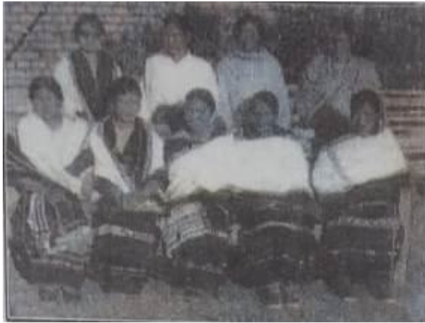
Makhan Women Society Ex-Pastors of Makhan Baptist Church