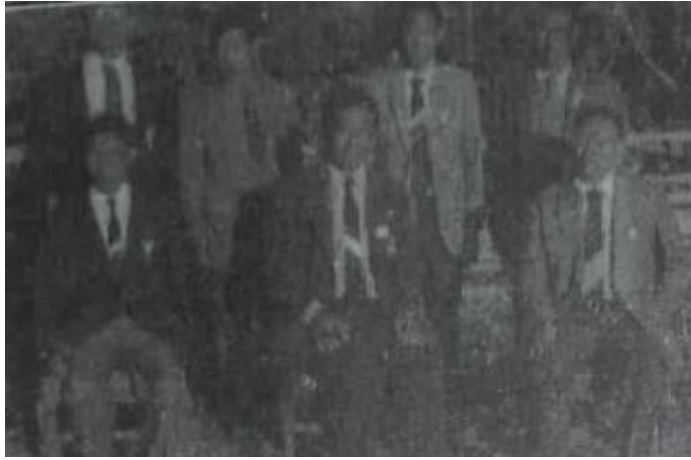
Golden Jubilee Committee