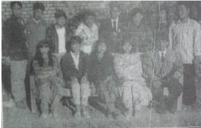
M.Y.C. Office Bearers